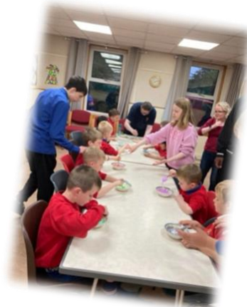
The Boys' Brigade