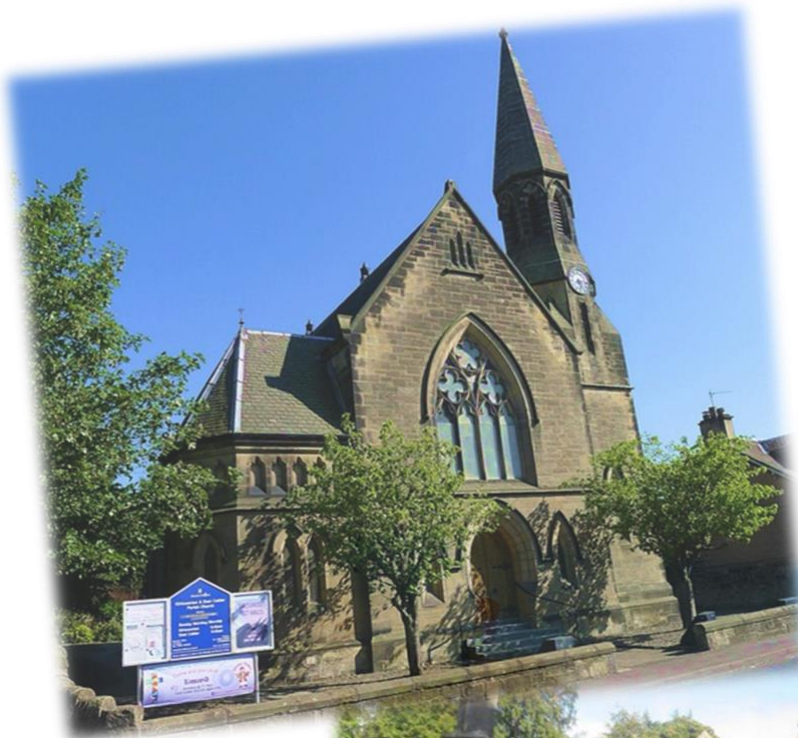
East Calder Church